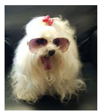
Molle Mae Croft

Things got a "little hairy" at two Blackstone offices when employees participated in "Take Your Dog to Work Day," an unofficial holiday created in 1999 by Pet Sitters International as a way to encourage dog adoption. Studies have shown that bringing pets to work can increase productivity, possibly because employees are shown how to work like dogs. Molle Mae Croft visited the Phoenix office. She is owned by Blackstone Executive Vice Pres-